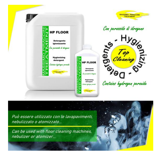
Coverage: 1 litre for approx. 100 m2

Suitable for floors, coatings and sanitary fixtures. Concentrated product, to be diluted with water. Once diluted and ready to use it contains 1 % of hydrogen peroxide, suitable for sanitizing as indicated by health supervision authorities. (Required percentage 0.5-1%) Product suitable for sanitizing as per indications of the Italian Ministry of Health and ISS Decalogue and circular letter n.5443 of the 22nd February 2020 of the Italian Ministry of Health.