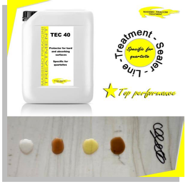
Coverage: 1 litre for approx. 20-30 m2 depending on the finish of the surface and on its absorption.

Water-and-oil repellent protector for hard and absorbing surfaces like quartzites, with polished or honed finish. Protects the surfaces from staining substances like oil, coffee, grease. It protects from dirt in general and makes cleaning easier. Specific for kitchen countertops, tables, floors and coatings.